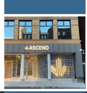
BOSTON GARDEN / FANEUIL HALL

Located near Palmer and Logan square steps to the train